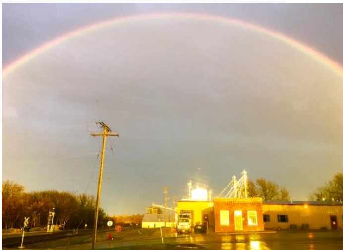
We had the most beautiful & vibrant double rainbow on March 15 th ! My pics don't do it justice!